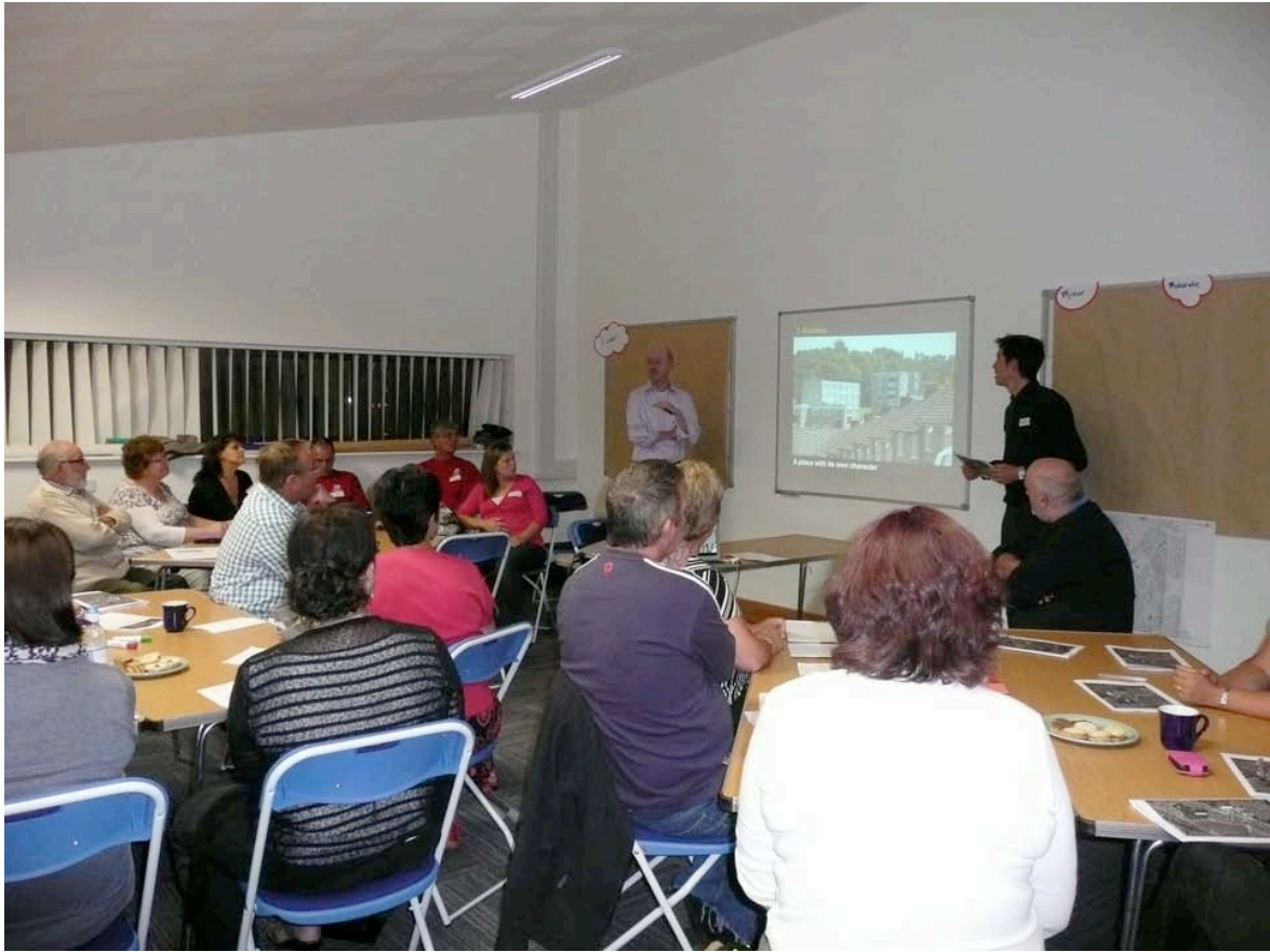
Figure 4. Team Event 1: Townhill Park Vision