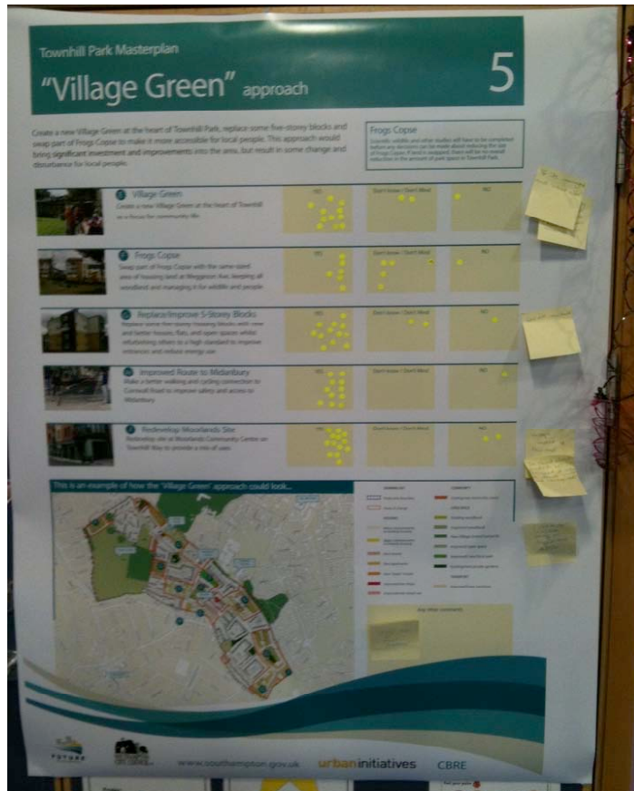
Figure 7. Exhibition Event 2: Different approaches to regeneration