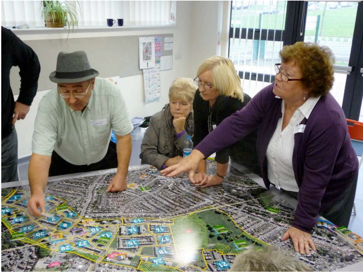
Figure 5. Team Event 2: Townhill Park Challenge