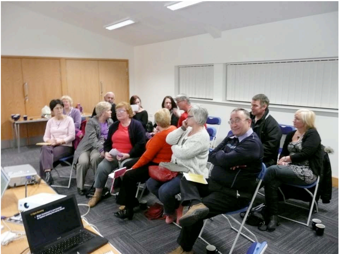
Figure 9. Team Event 3: Draft Regeneration Framework