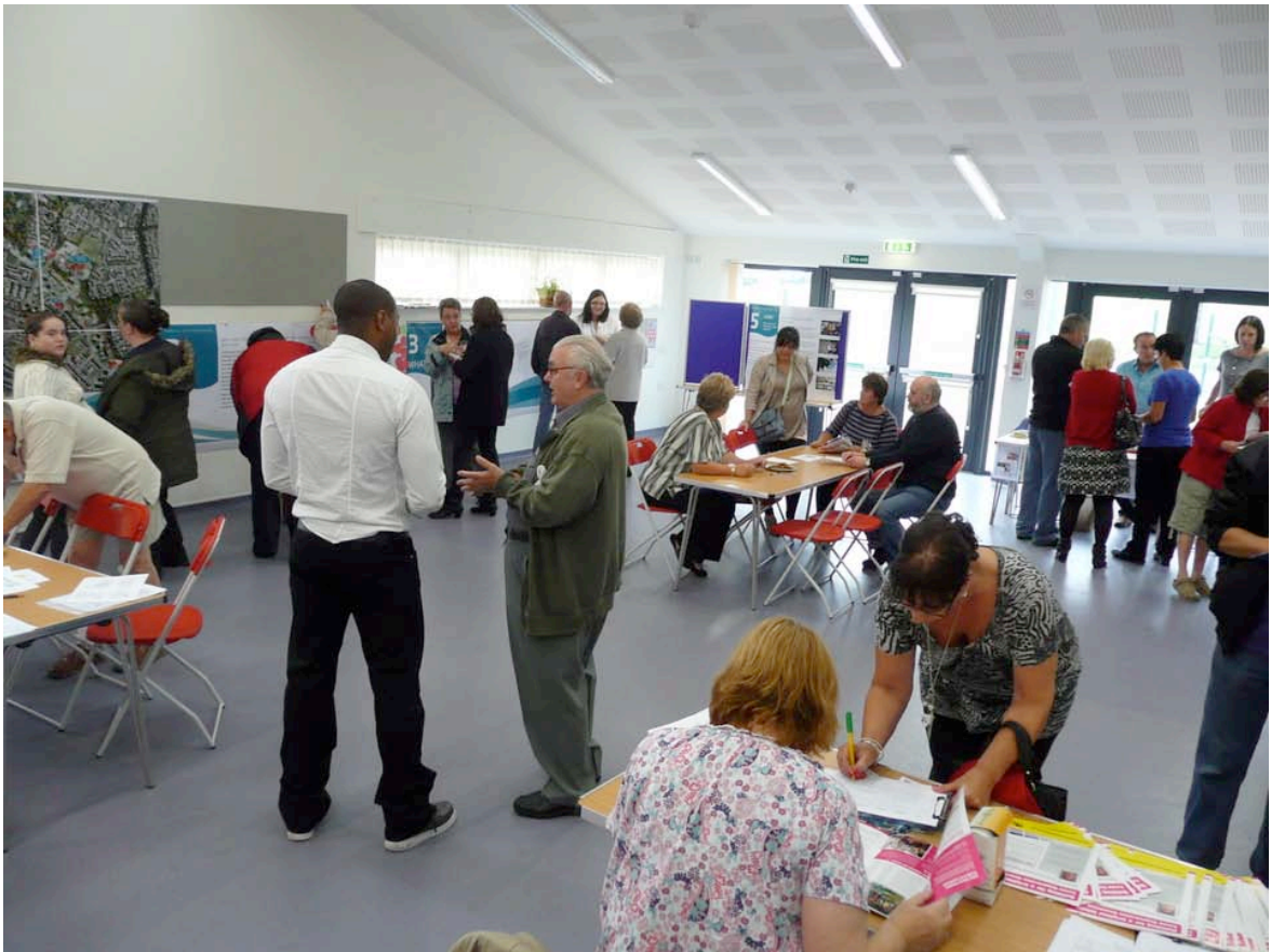
Figure 2. Exhibiton 1: Introducing the process